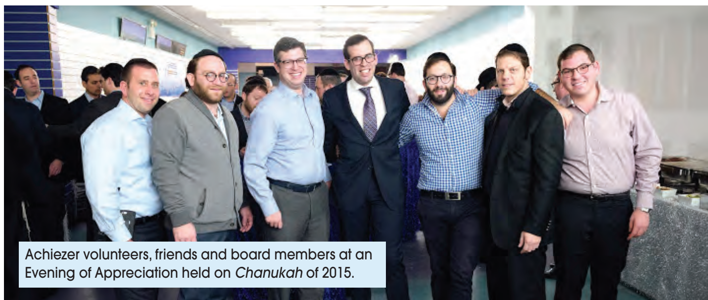
Achiezer volunteers, friends and board members at an Evening of Appreciation held on Chanukah of 2015.

I can try, though it would take a while.