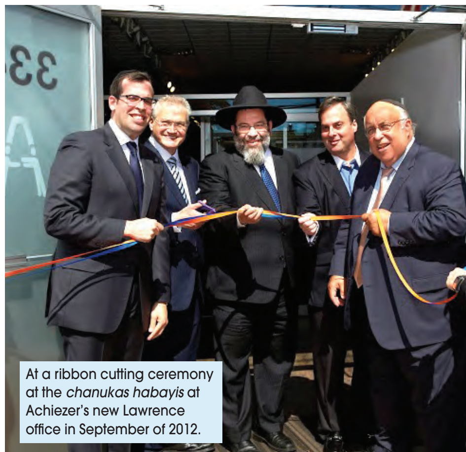
At a ribbon cutting ceremony at the chanukas habayis at Achiezer's new Lawrence office in September of 2012.

Our second Far Rockaway based program is Meals and More, a program that delivers meals to patients in eight different hospitals. Our meals, which are cooked by nearly 100